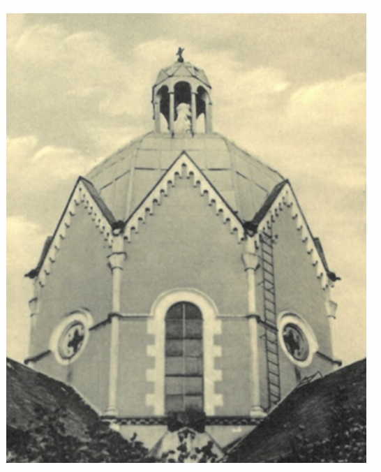
Undated photography