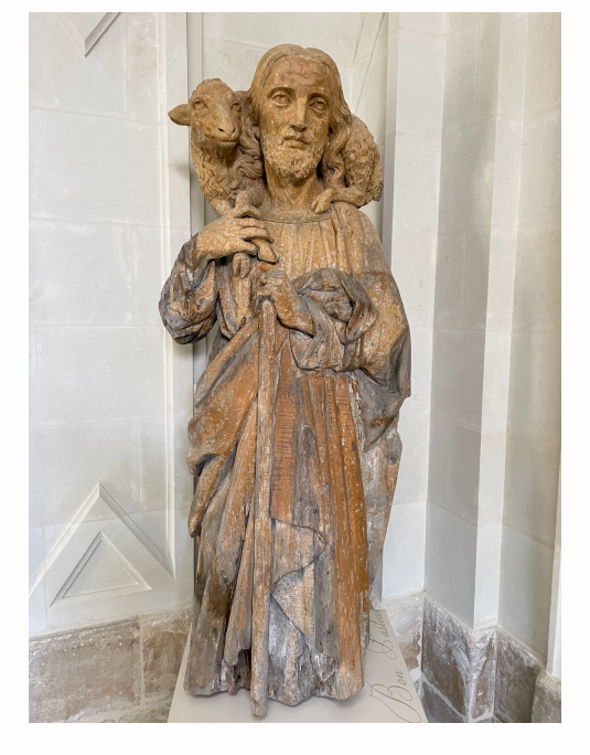
Statue of the Good Shepherd

It remained in good condition and was slightly restored in 2014, especially to seal a few cracks.