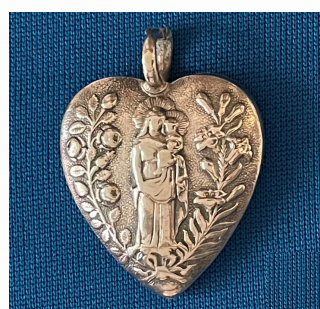
Heart worn by the Sisters of Our Lady of Charity

Since the foundation of the Congregation in the 17th century, each sister received a silver heart on the day of her profession, in reference to the heart of Jesus and Mary, a founding element of the spirituality of Saint John Eudes. Inside this heart, worn on their habit, the Sisters carried the formula of their vows, written and signed by them, as well as relics of the founders.