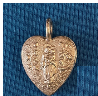
Heart worn by the Sisters of the Good Shepherd

On the original heart is on one side the Virgin and Child surrounded by lilies, symbol of purity, and roses, and on the other the inscription "Vive Jesus and Mary" (Live Jesus and Mary).