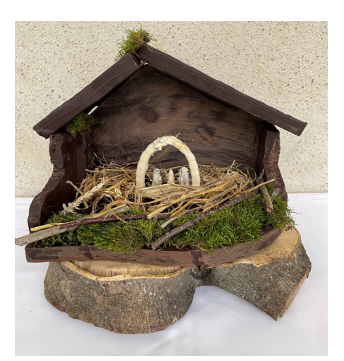
Chocolate crib. A creation of the restaurant "Le Tournemine".

A special thank you also to the team of Le Tournemine, the restaurant of the hotel of the Good Shepherd, who created a 100% chocolate crib for this exhibition!