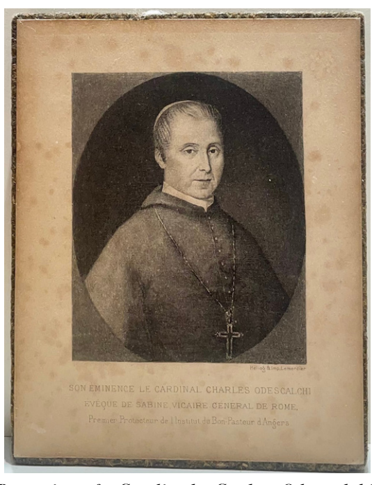
Portrait of Cardinal Carlo Odescalchi, 13x10.5 cm, Bishops' Room in the Museum.

The portrait and last letter of Cardinal Odescalchi