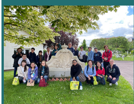
Park of the community, in Cormelles-le-Royal