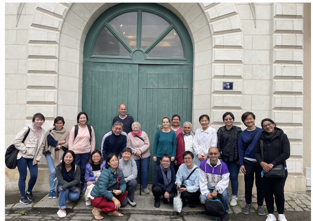
Historic entrance to the Mother House, 3 Rue Brault, Angers

They all spoke of the richness and depth of their experience, particularly for those who work on a daily basis with people in difficulty.