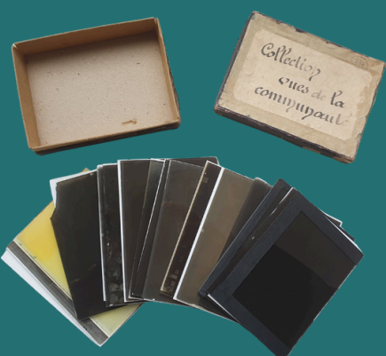
Box and its content