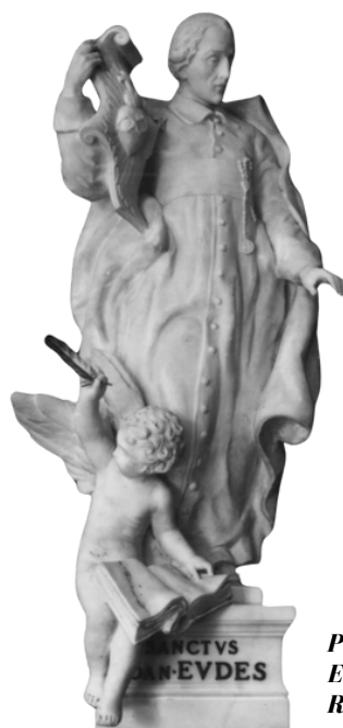
Photo of the statue of Saint John Eudes, in St Peter's Basilica in Rome.

You can download the full text of the Bulletin, in three languages, by clicking here.