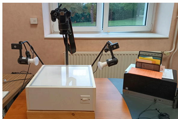
A device for digitising the plates, lent by the Angers diocesan archives.

The collection comprises 5,865 plates, dating from 1909 to 1961.