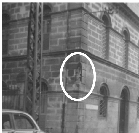
Photos of the house of Avignon, Guillaume Puy Street.