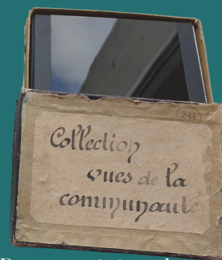
Box containing glass plates

Fabienne Ouvrard , Archives Department, Angers.