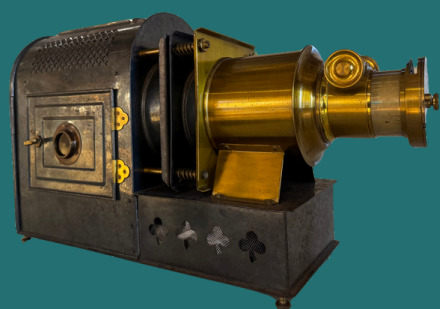
Device for projecting glass plates in the Museum